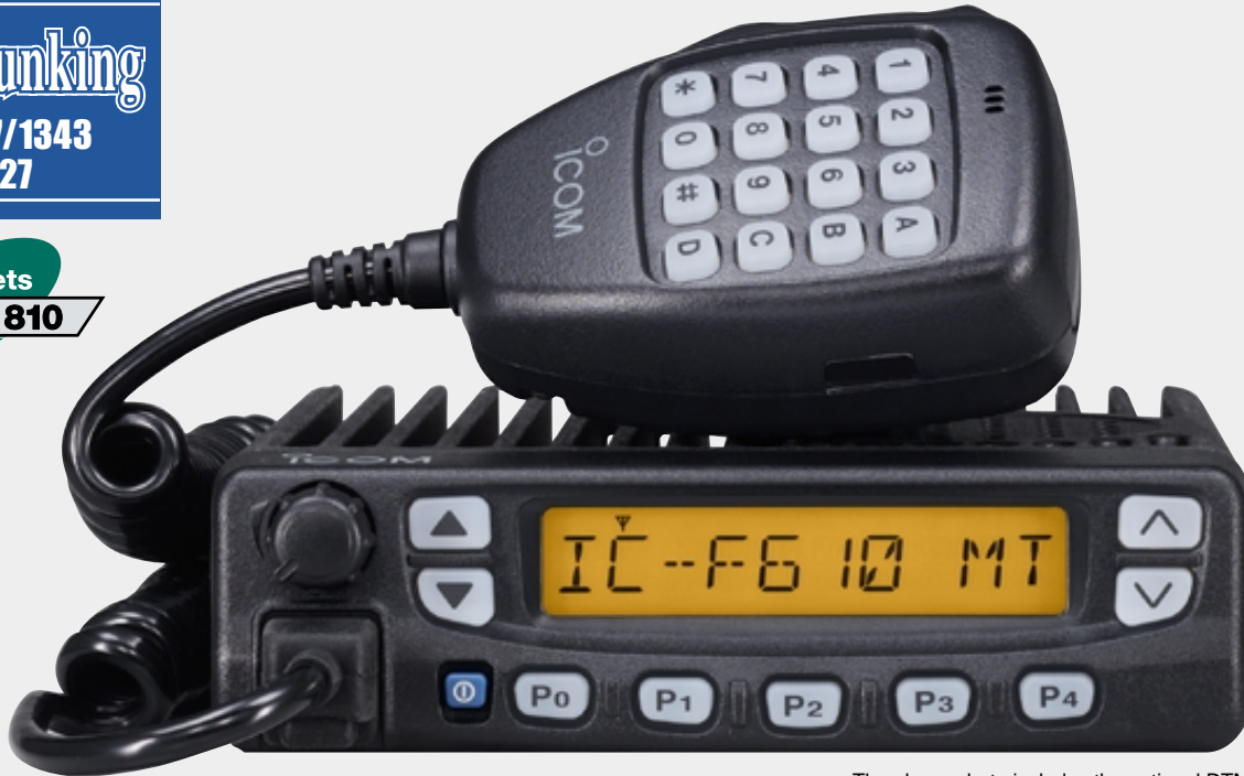
The above photo includes the optional DTMF MIC, HM-100TN.